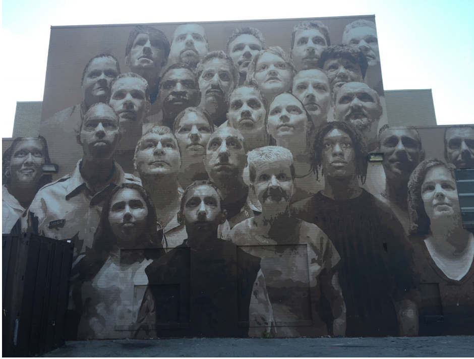
Figure 4. Mural on a recreation center in Philadelphia, PA. Copyright 2015 by Bobbi Sue Padro Van Leuven.