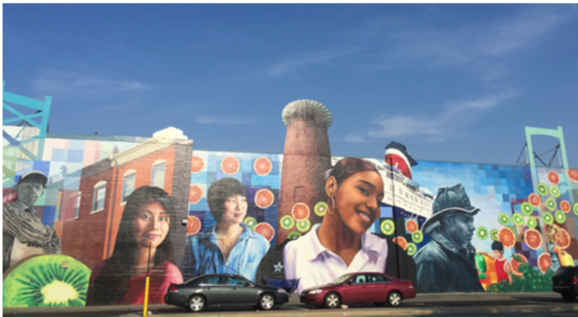
Figure 5. Mural on the side of a grocery store in Philadelphia, PA.