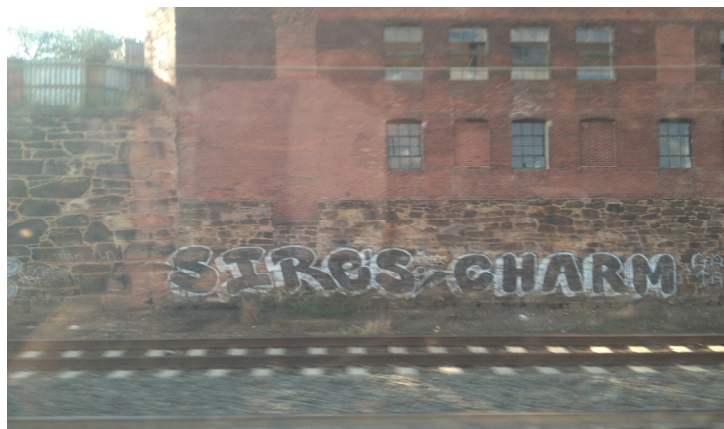
Figure 1. Tagging by tracks of the Southeastern PA Transportation Authority train in Philadelphia, PA.